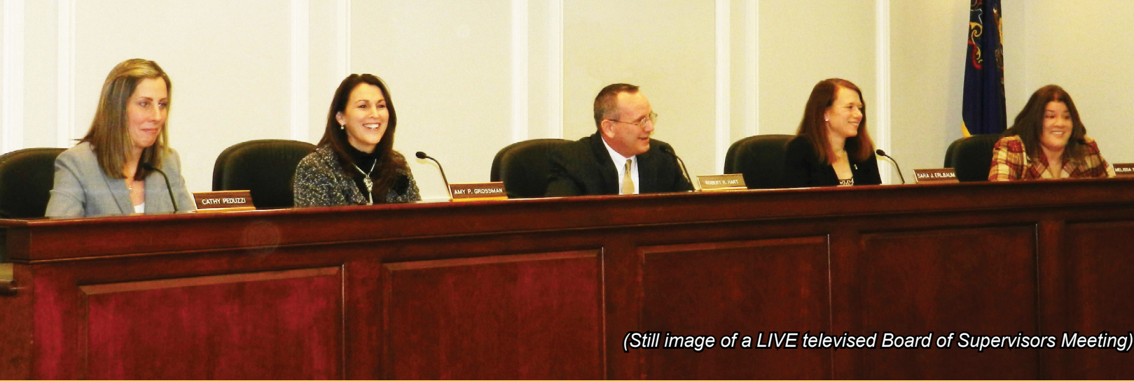
(Still image of a LIVE televised Board of Supervisors Meeting)